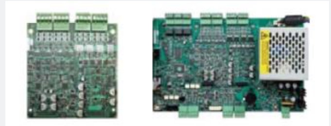
AX-LPD 2 SLC & 2 NAC Expansion - AX-CTL-2PCB Base Card