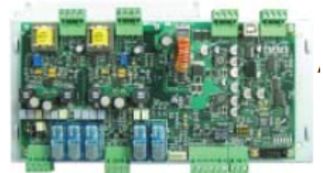
AV-AMP-80 Audio Amplifier

AV-MIC: Microphone with enclosure. Mounts to all Modular Command Center inner doors, in a single aperture location.