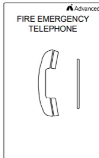
AV-TEL2-WD3 Master Addressable Firefighter Telephone w/Magnetic Latch