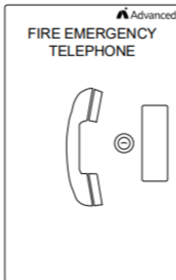
AV-TEL2-WD2 Master Addressable Firefighter Telephone w/Keylock