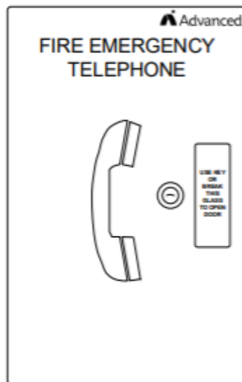
AV-TEL2-WD Master Addressable Firefighter Telephone w/Breakglass & Keylock