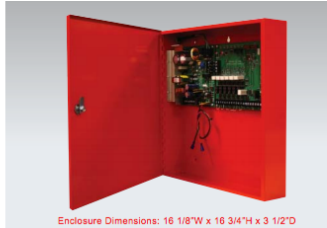
Enclosure Dimensions: 16 1/8"W x 16 3/4"H x 3 1/2"D

The power supply contains simple dipswitch programming and LED indications providing the installer with indications of the operation and the ability to correct any faults. A Trouble Memory is provided to allow an installer to review past troubles and make the necessary repairs. Each output has an LED to pinpoint the exact circuit where a problem may have occurred. Relays are provided for monitoring the general system and AC failure.