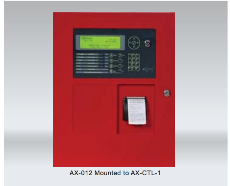
AX-012 Mounted to AX-CTL-1

Spare rolls of thermal paper can easily be replaced due to the mechanisms easy access front-loading compartment.